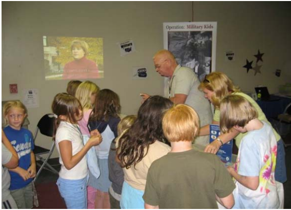
Pictured above OMK at 2008 Nebraska State Fair - Cyber Fair

We are on the web! See us at: State-www.nebraskaomk.org ; National-www.operationmilitarykids.org