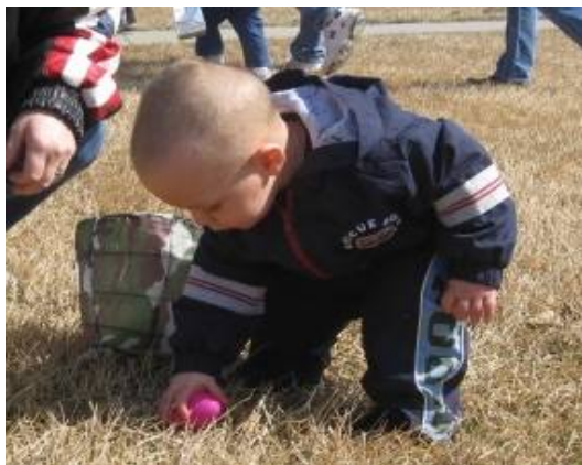
Pictured above is a little tyke finding goodies.