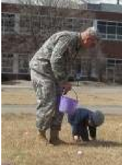
Above a soldier and child looking for Easter Eggs.