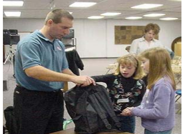
Hero packs being distributed. Story at left.