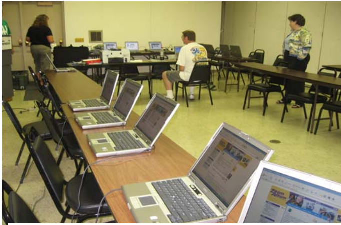
Setting up of Mobile Technology Lab (MTL)